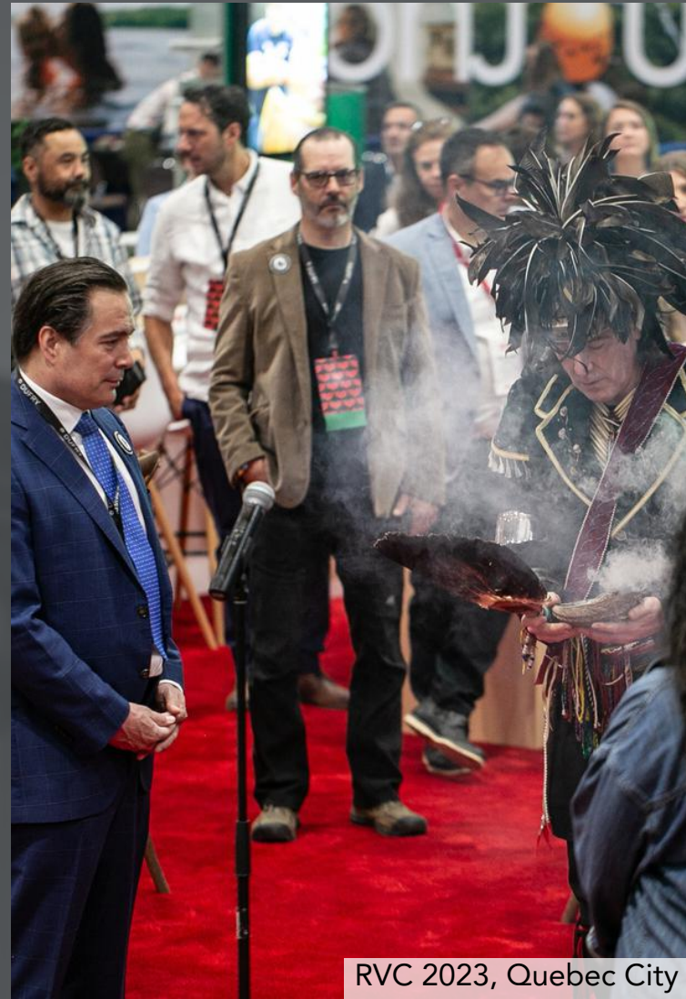
RVC 2023, Quebec City