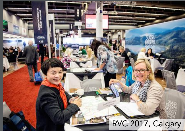
RVC 2017, Calgary