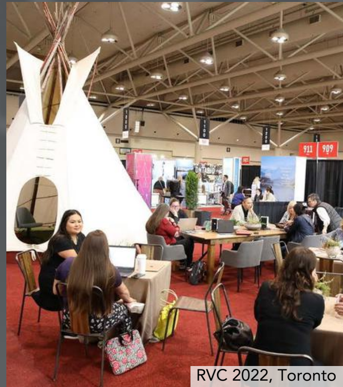
RVC 2022, Toronto