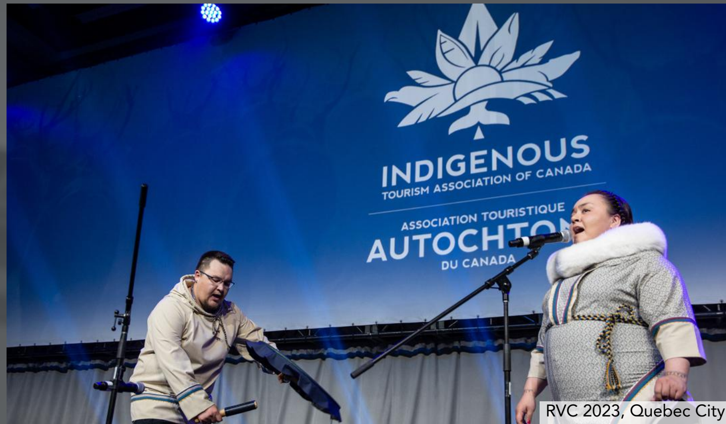
RVC 2023, Quebec City