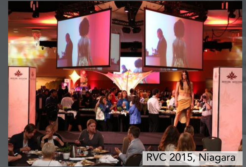
RVC 2015, Niagara