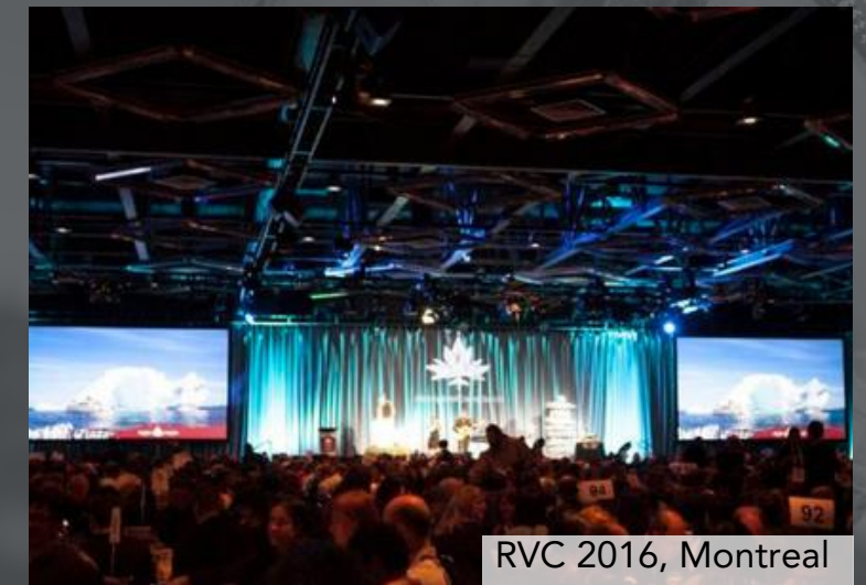
RVC 2016, Montreal