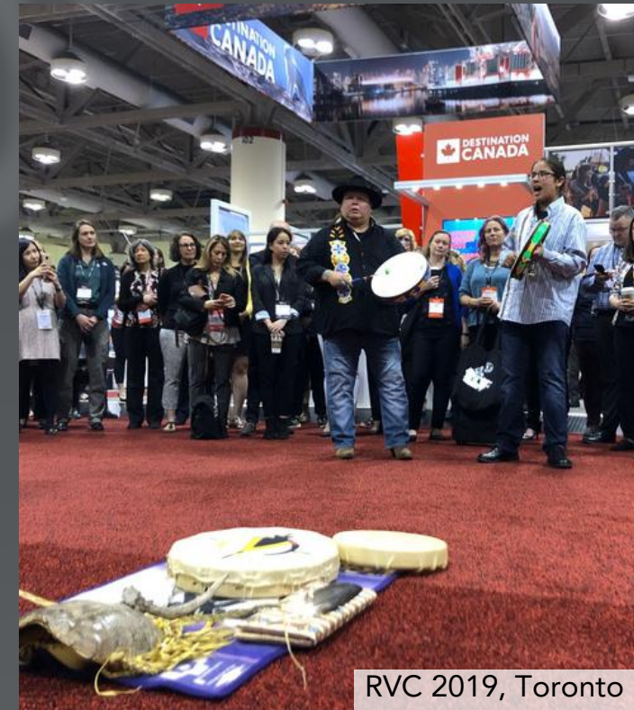
RVC 2019, Toronto