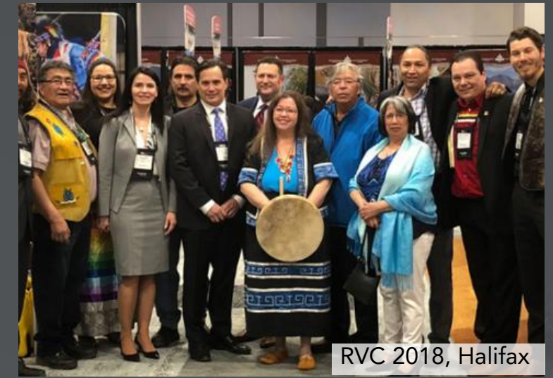
RVC 2018, Halifax